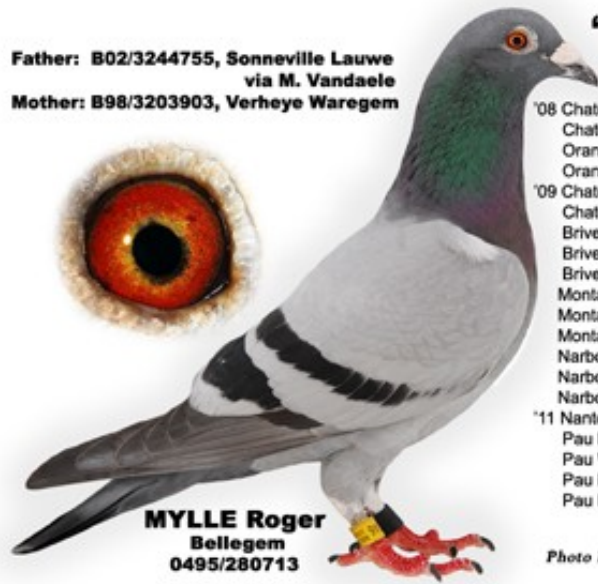
MYLLE Roger Bellegem 0495/280713